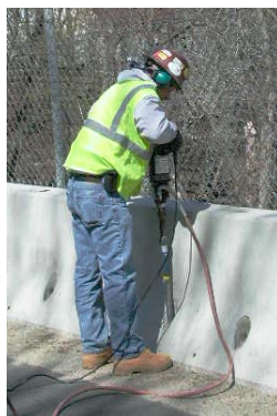
Great for barrier use